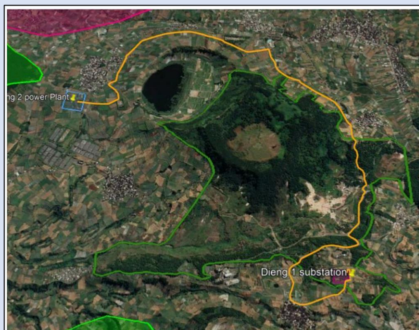
Figure 9.2: Location of Dieng geothermal expansion project in Java, Indonesia